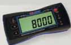
MSI-8000 RF Remote Display